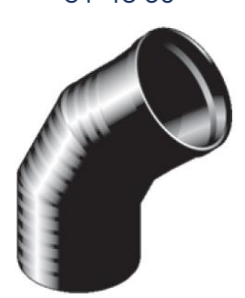
31° to 60°