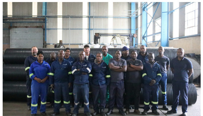
Our Manufacturing Team

Don't fret if you have specific requirements and warranties, you can call us or email us and we will get back to you with the same Rho-Tech service you know and love.